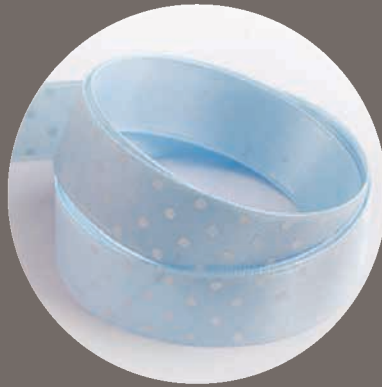
Blue Topaz 308 White Print - 16mm