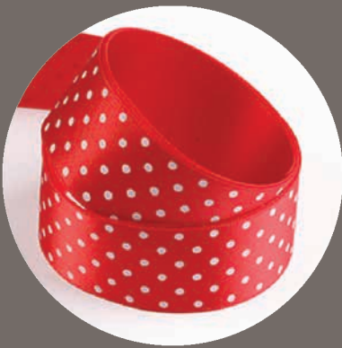
Passion 840 White Print - 25mm

Ribbon is woven to the double-sided satin finish and then dyed to the colour required. A further process of screen printing then prints the polkadot spots.