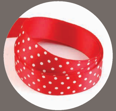
Red 250 White Print - 16mm