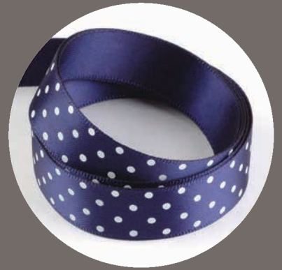
Navy 370 White Print - 25mm