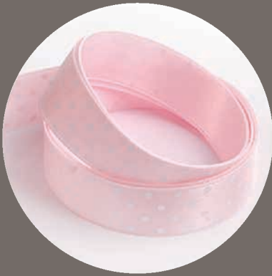
Light Pink 117 White Print - 16mm