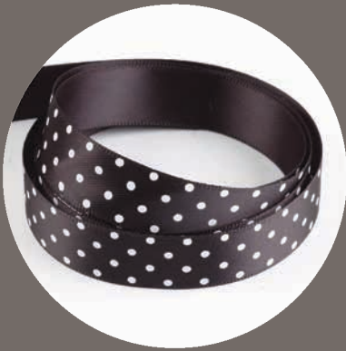
Black 030 White Print - 25mm