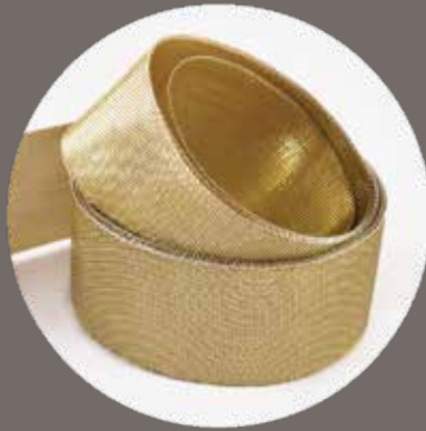
495 Liquid Metallic Nylon