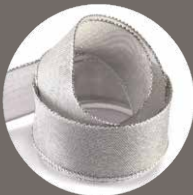
490 Metallic with Wire Edge