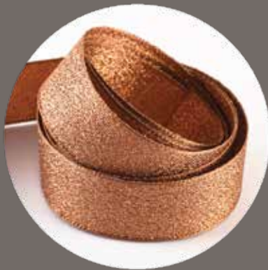
4505 Polyester Lame